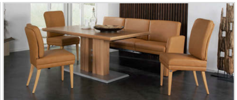
Composition: 33 / 2x 7213 33 / 1x 7212 21 – Cover: 24 Longlife gobi variant 33 with Ergoselect function and adjustable armrest