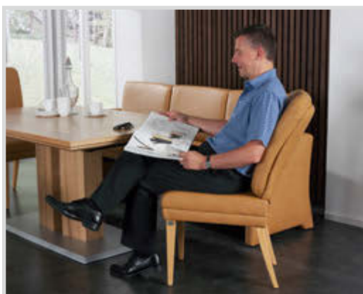
chair 7212 with adjustable backrest