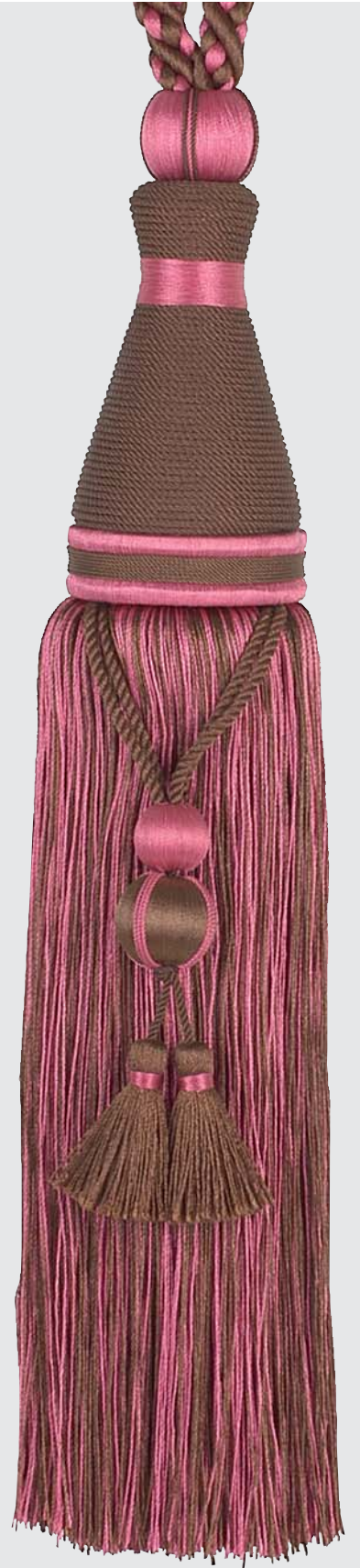
35874 / 9450